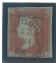
PLATE 154 LONDON NW JV 11 89 CDS