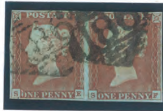
PLATE 102 SE-vertical mark in NWSA. ↓