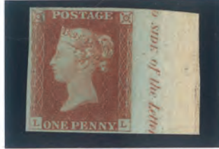
PLATE 41 MINT FULL GUM