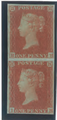
PLATE 127 BOTH ORIGINAL GUM