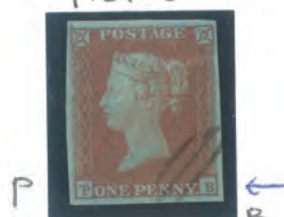
PLATE 107 cancel clear of profile