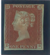
PLATE 34 DOUBLE 'D' ORIGINAL GUM