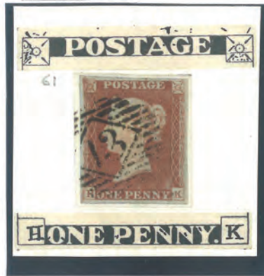
PLATE 61 RE-ENTRY