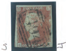
PLATE 105 INVERTED 'S'