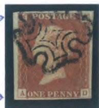
PLATE 2 RE-ENTRY