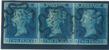
PLATE 3 1844 CANCELS