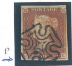
PLATE 16 RE-ENTRY GREENOCK MX