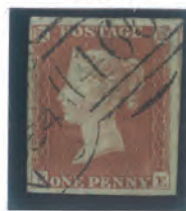
PLATE 162 466 LIVERPOOL SPOON