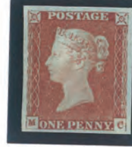
PLATE 80 FRESH ORIGINAL GUM