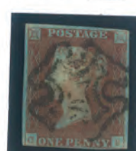
PLATE 5 STATE 3