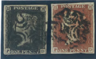
PLATE 2 RED MX BLACK MX