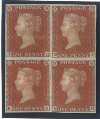
PLATE 131 FULL GUM C