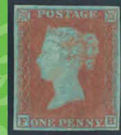
SG 12 PLATE 145