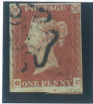
PLATE 81 MX and RE-ENTRY