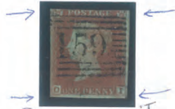
PLATE 132 RE-ENTRY