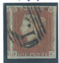
PLATE 73 RE-ENTRY