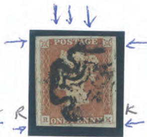
PLATE 26 RE-ENTRY