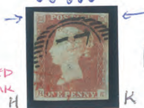
PLATE 84 RE-ENTRY