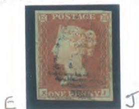
PLATE 117 FOUL STOP FLAW