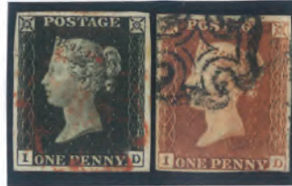
PLATE 5 RED MX BLACK MX