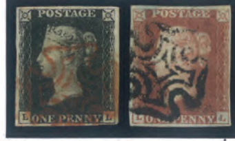
PLATE 8 BLACK MX'S