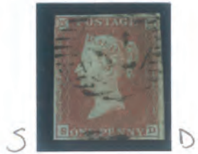
PLATE 124 INVERTED 'S'