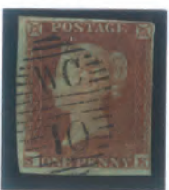
PLATE 167 WC 10