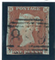
PLATE 40 STATE 2 £75