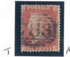
PLATE R16 £1100