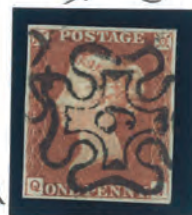
PLATE 28 STATE 2 NO GIIA X £100