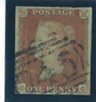
PLATE 85 £20