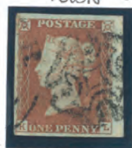
PLATE 20 BLACK MX + TOWN £50