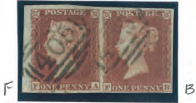
PLATE 172 MULTIPLE + VARIETY £70