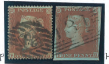
PLATE 98 178 £450