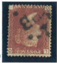
PLATE 173 £80 188 £50