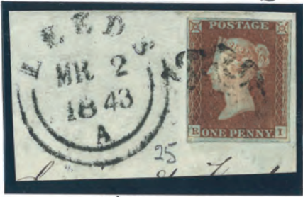
147 R I