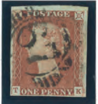
PLATE 67 £20