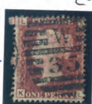
PLATE 195 £30