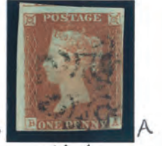
PLATE 25 STATE 2 £80