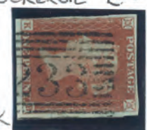
PLATE 43 112 233 LOCKERBIE £20