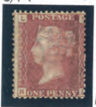
PLATE 157 U/M £30