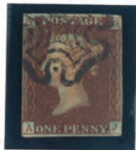
PLATE 8 STATE 2 AS55A MX? £100