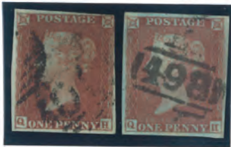
PLATE 155 STATE 2 £150