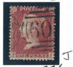
PLATE 155 224 155 PERF STATES 155 155 STATES 155 155 STATES 176 STATE 2 £25