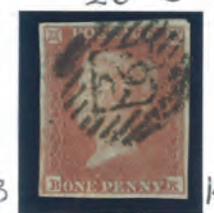
PLATE 130 117 LONDON 26 £25