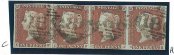
PLATE 81 MARK IN 'C' OF 'E'