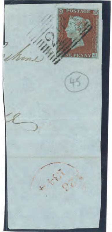
I J K PLATE 45 NJ £25