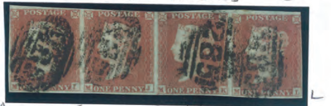
PLATE 171 CONSTANT VARIETIES £70