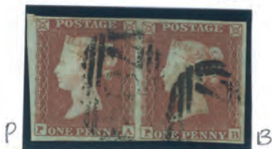
PLATE 171 £70