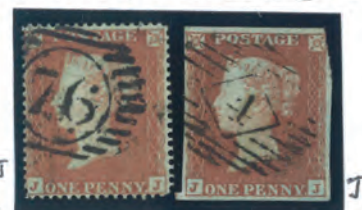
PLATE 100 HILL COMB 3 £400