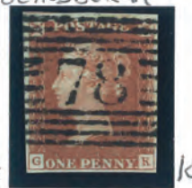
PLATE 31 107 78 COLINSBURGH £50