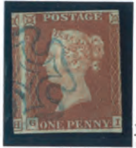
PLATE 17 BS 6SC GREY/BWE £50