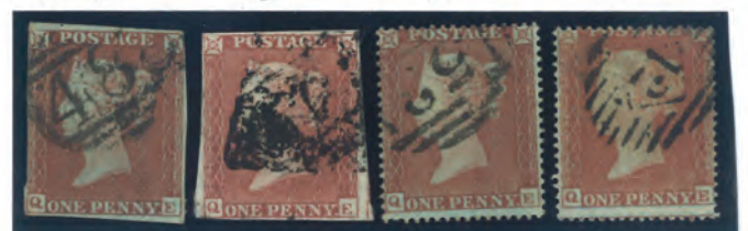
PLATE 93 WILKINSON COMB 1 £800