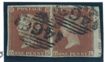
PLATE 155 STATE 1 £70