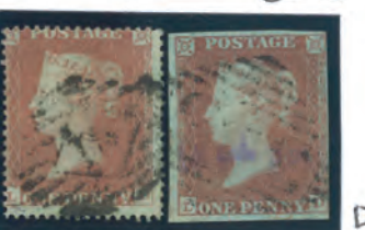
PLATE 101 IRISH A23. TAVLAGHT £850