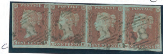
PLATE 168 IRISH 380 PORTUMNA £140