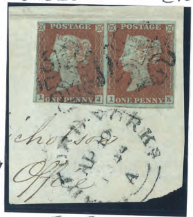
PLATE 36 £40