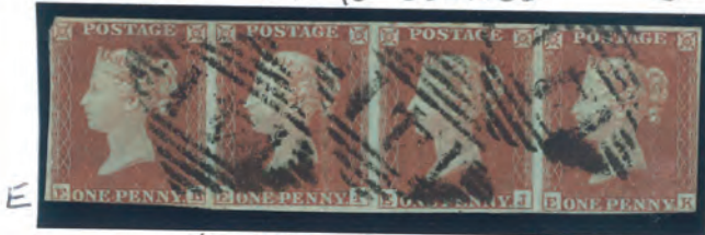
PLATE 149 141 FOR CLONES £130