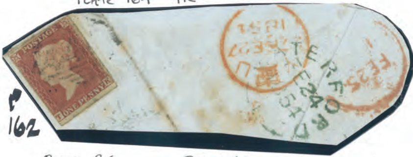
PLATE 8 STATE 2 £50