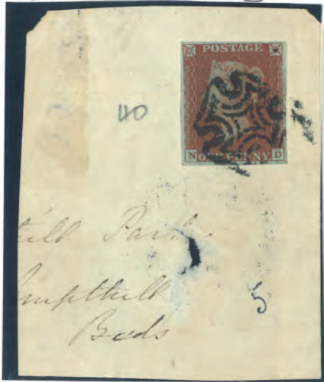
150 N D