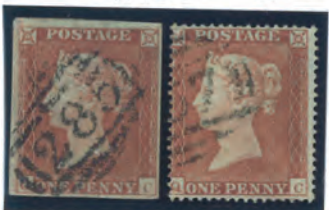
PLATE 173 MATCHED PAIR £50