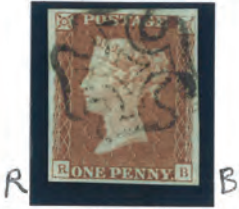
PLATE 25 STATE 2 £100