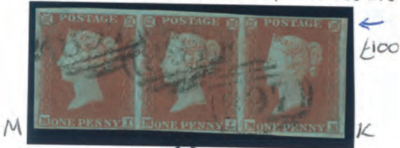
PLATE 137 MARK IN BASE OF NE WISEBEAK