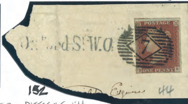
152 at Engine 44