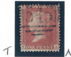
PLATE R15 £1200