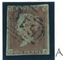
PLATE 155 STATE 2 £100