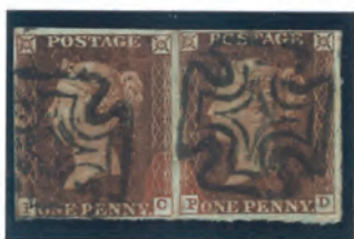
PLATE 41 DUBLIN MX £100