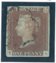
PLATE 13 £60