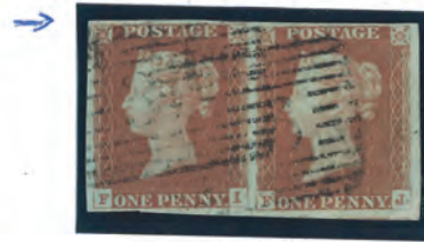
PLATE 75 MARKS IN NW SQ. £50