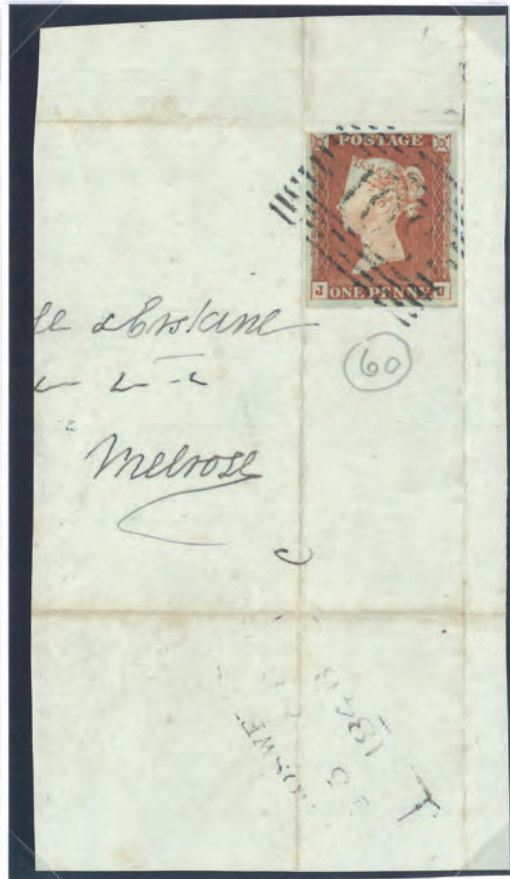
21A PLATE 75 CJ KINCARDINE £35 O'NEILL