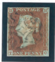
PLATE 23 BS12Eg COVENTRY