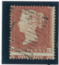
PLATE R2 £40