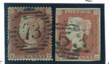
PLATE 99 CV mark £450