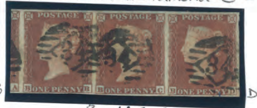
PLATE 164 34 IN DIAMOND £100