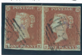
PLATE 126 WELSH 164 for CARDIGAN £40