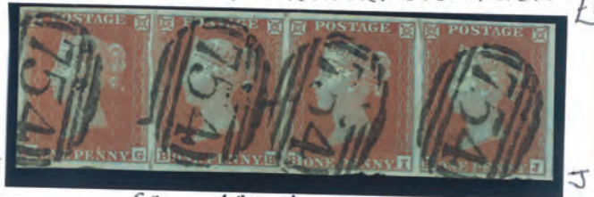
PLATE 142 754 STRATFORD UPON AVON £100