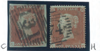
PLATE 172 MATCHED PAIR £50