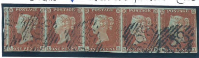
PLATE 55 strip of 5 'E' FLAW