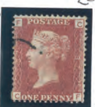
PLATE 187 £30