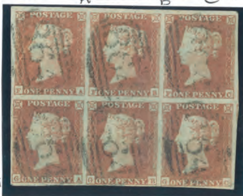
PLATE 111 A Block of 6 £200