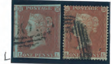
PLATE 155 STATE 2 STATE 3